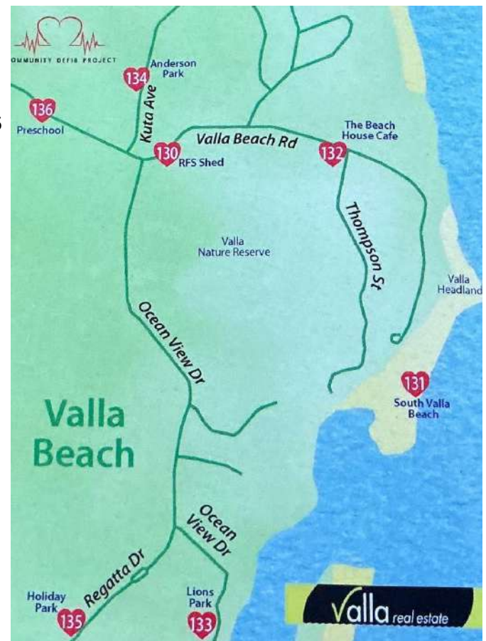
Defibrillator Locations in Valla Beach