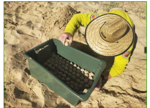
Loggerhead nest relocation on the Mid Coast by NPWS.