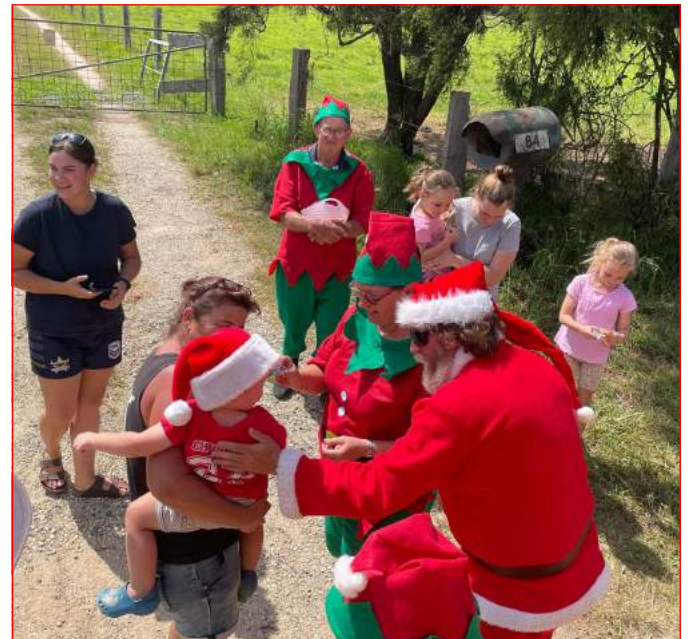
(Nice gate scene): Ho, ho, ho – Santa and helpers roll into Valla