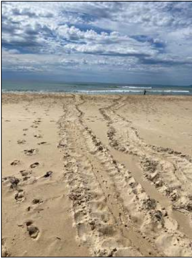
Green tracks on the Nambucca Valley.